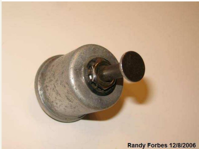
Randy Forbes 12/8/2006