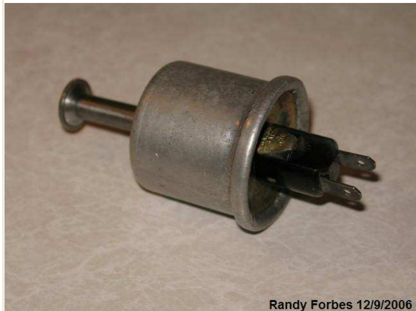
Randy Forbes 12/9/2006