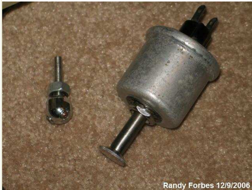
Randy Forbes 12/9/2006