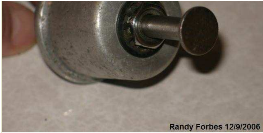
Randy Forbes 12/9/2006