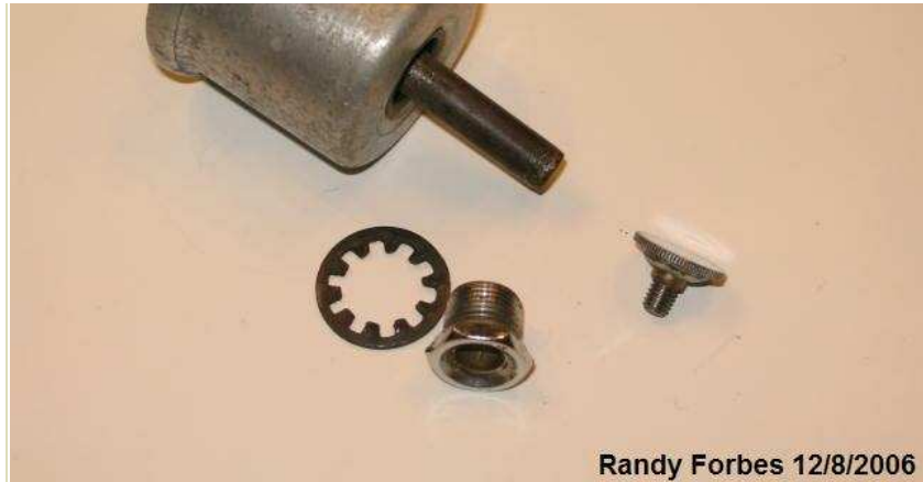
Randy Forbes 12/8/2006