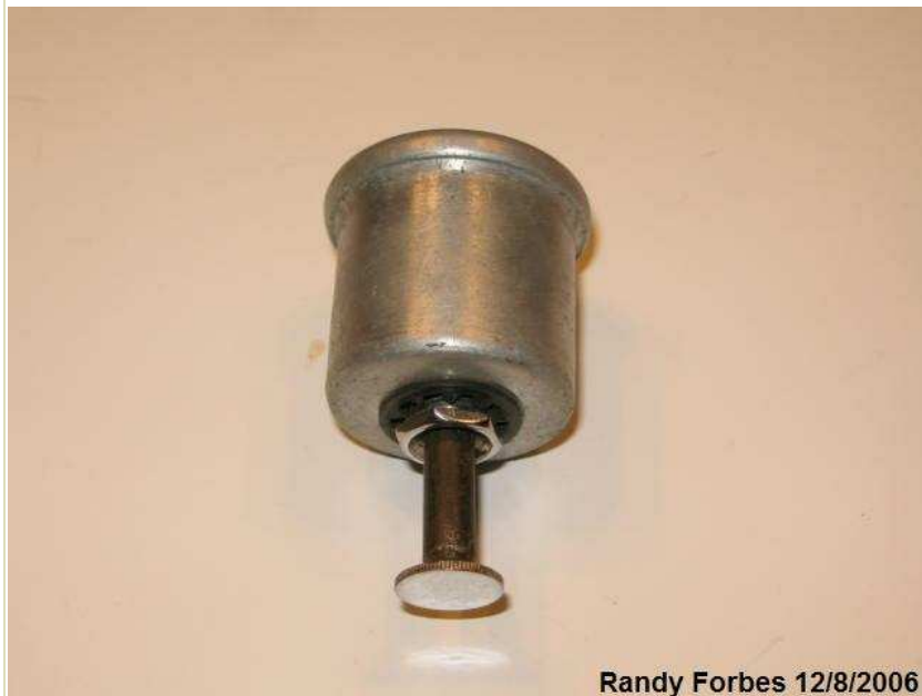
Randy Forbes 12/8/2006

In the meantime, perhaps you can scale something from these; it will at least let you get the ball rolling: