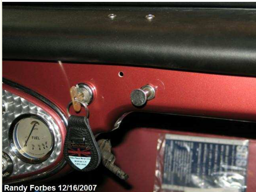
Randy Forbes 12/16/2007