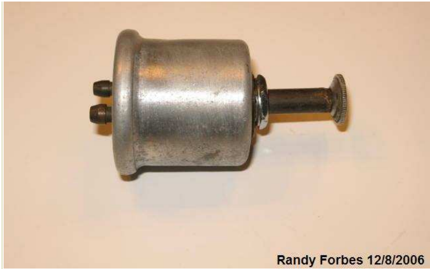
Randy Forbes 12/8/2006