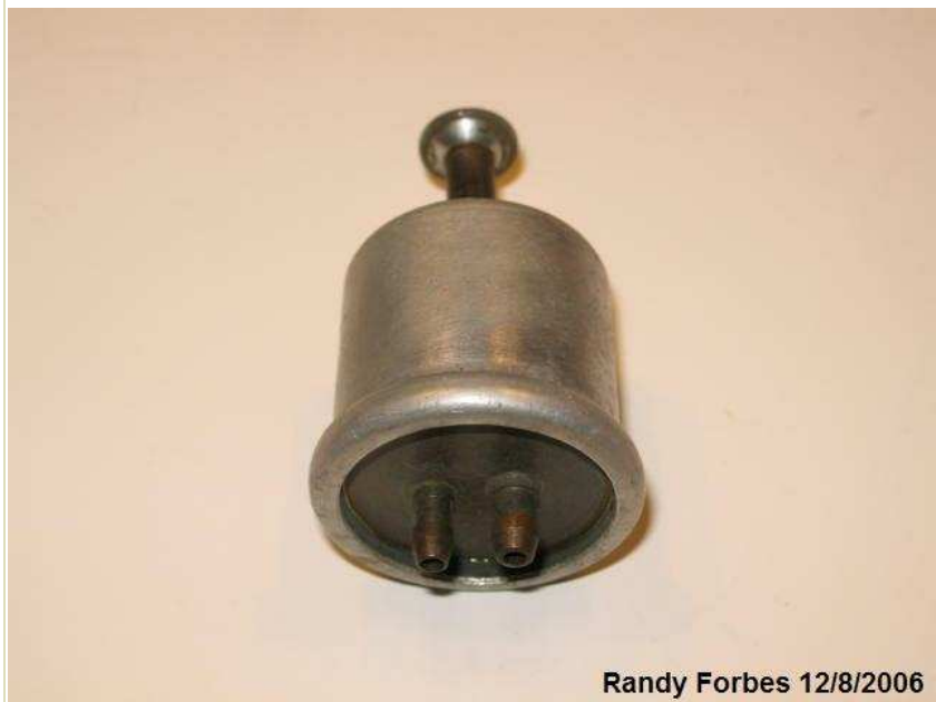
Randy Forbes 12/8/2006