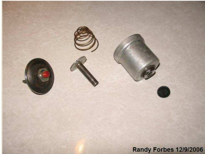
Randy Forbes 12/9/2006